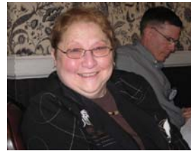
Ware Shoals News