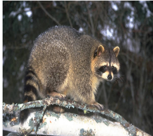
Former Member, Turkey Creek Coon Hunters Association